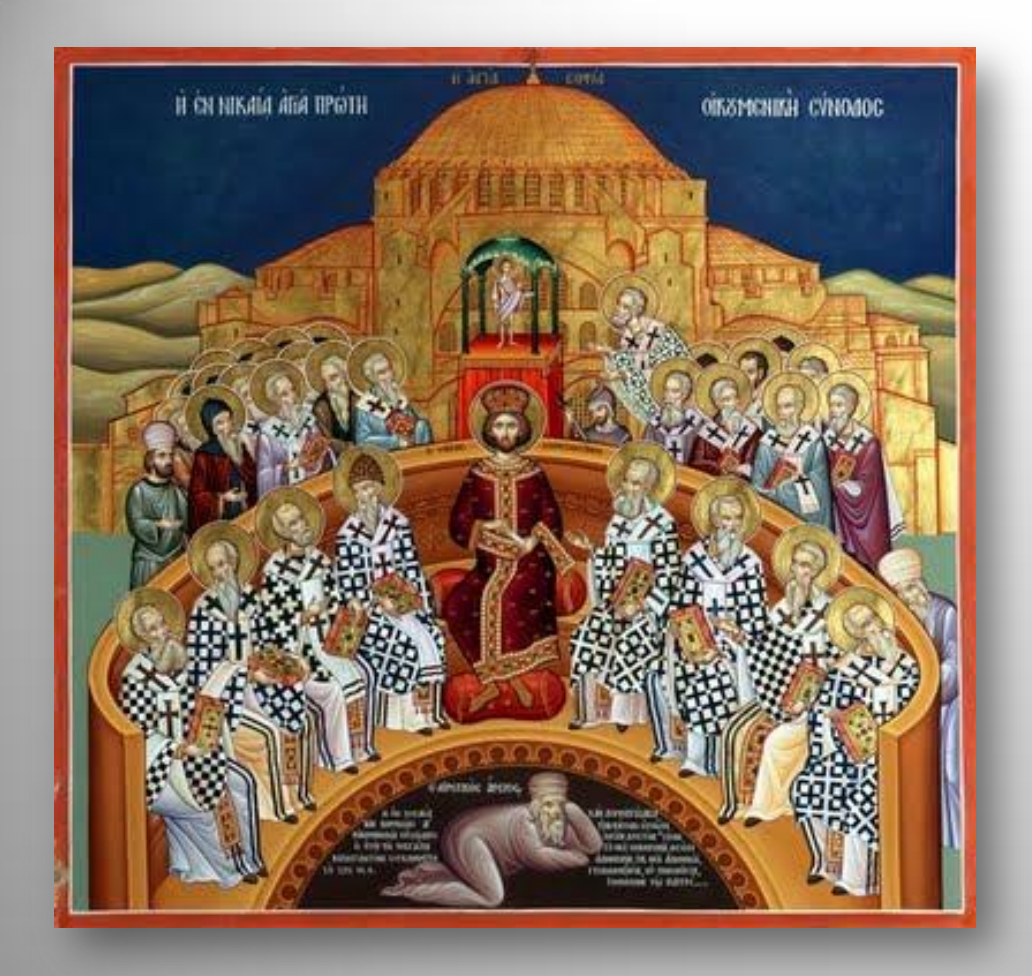
The Nicene Creed