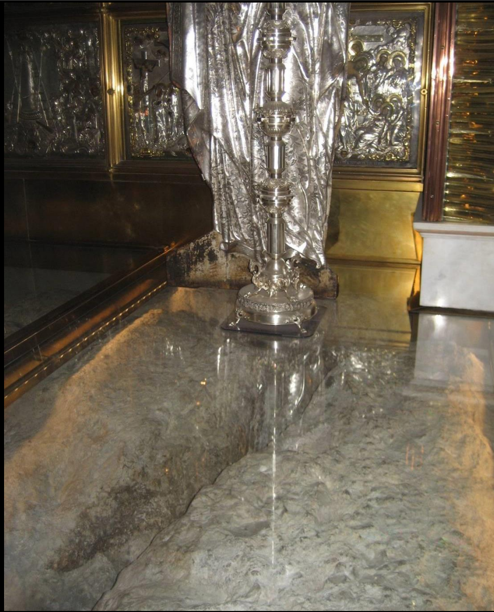
Silver Icon of Mary stands on glass covering the fissure in the rock