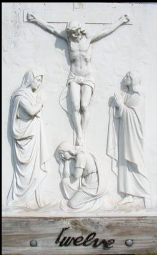
St. Joseph's Cemetery Stations of the Cross - Circleville, OH