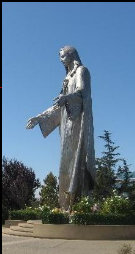
The Shrine of Our Lady of Peace Stations of the Cross - Santa Clara, CA