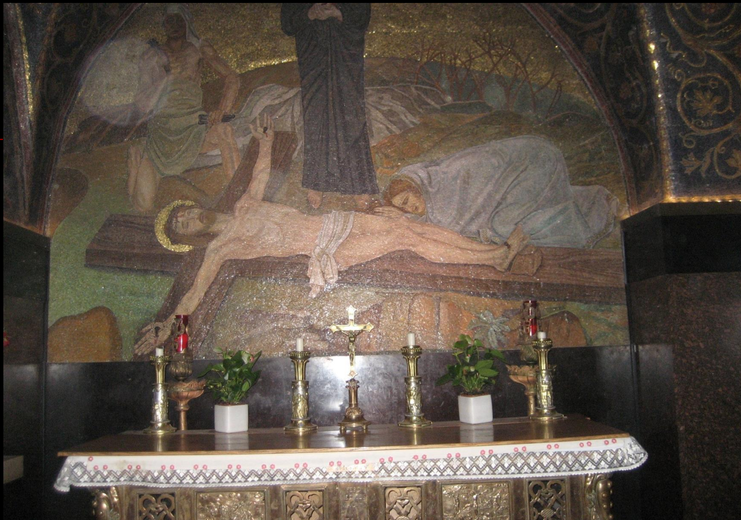
11 th Station: Mosaic above the altar—Jesus is nailed to the cross