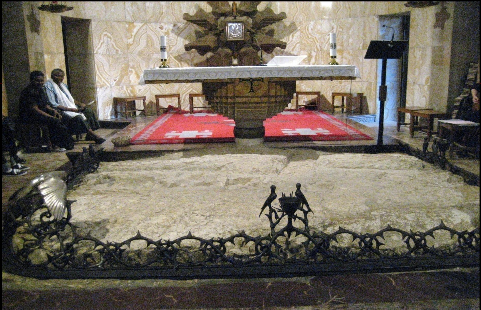
Traditional Rock of the Agony surrounded by a wrought iron Crown of Thorns in front of the altar in the Basilica of the Agony