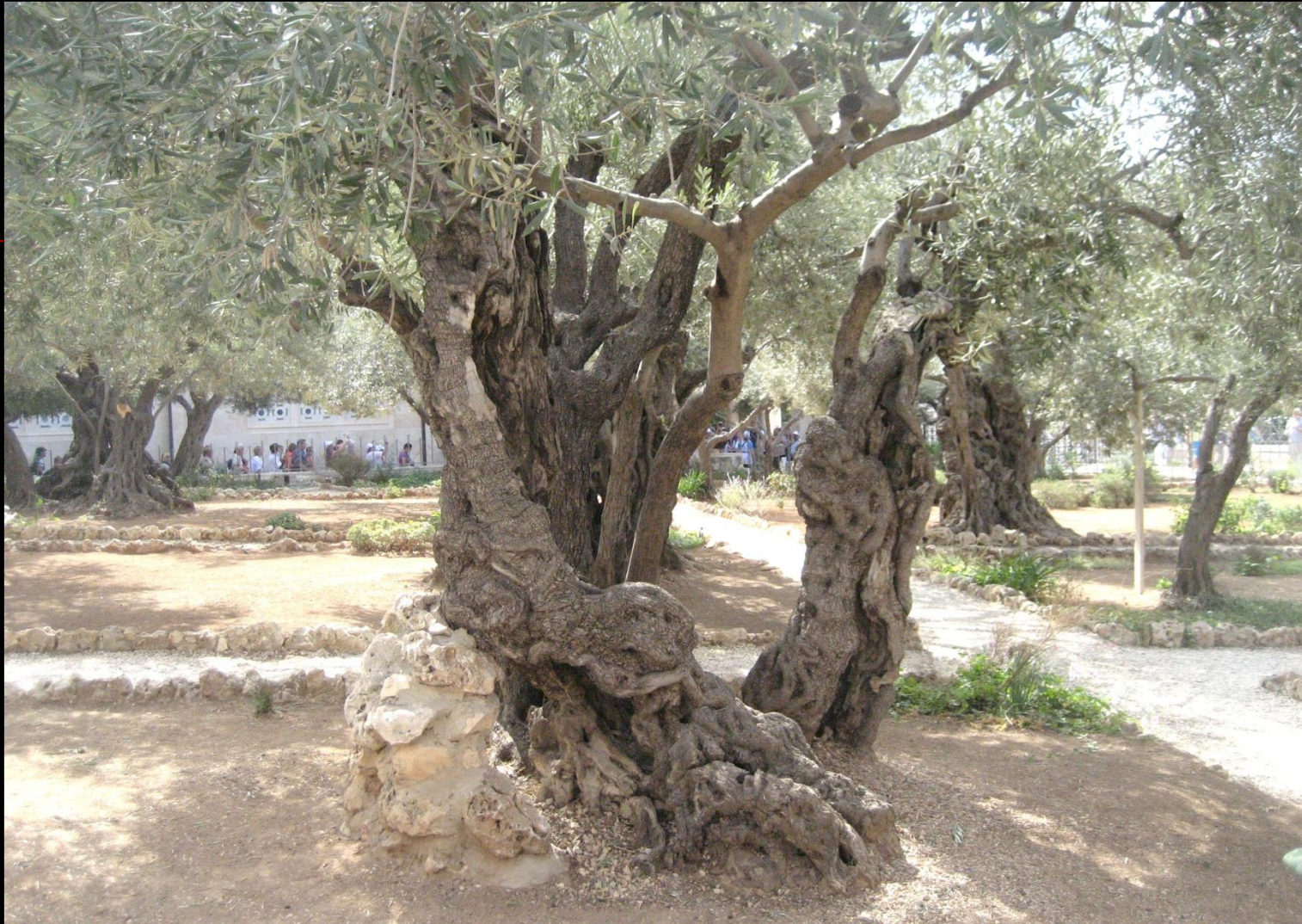
Garden of Gethsemane—has 8 ancient olive trees