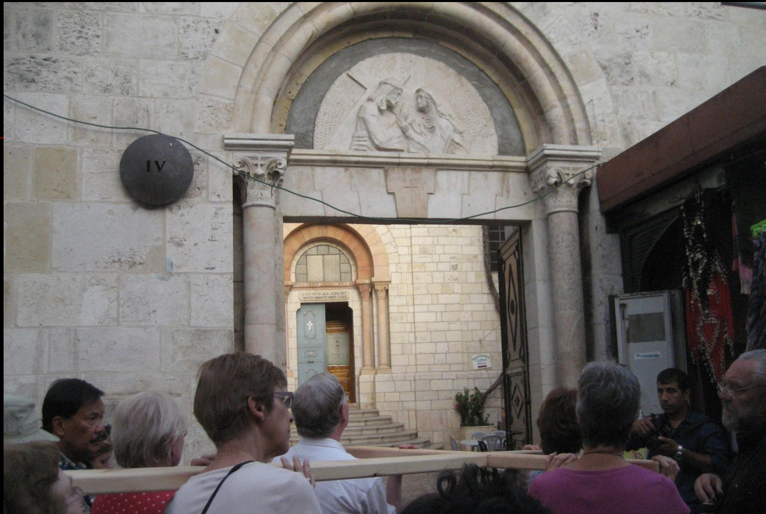
4 th Station: The Armenian-Catholic Church of Our Lady of the Spasm—marks the place where Mary encountered Jesus