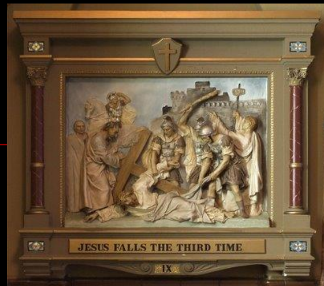
Saint Charles Borromeo Church, Saint Charles, Missouri