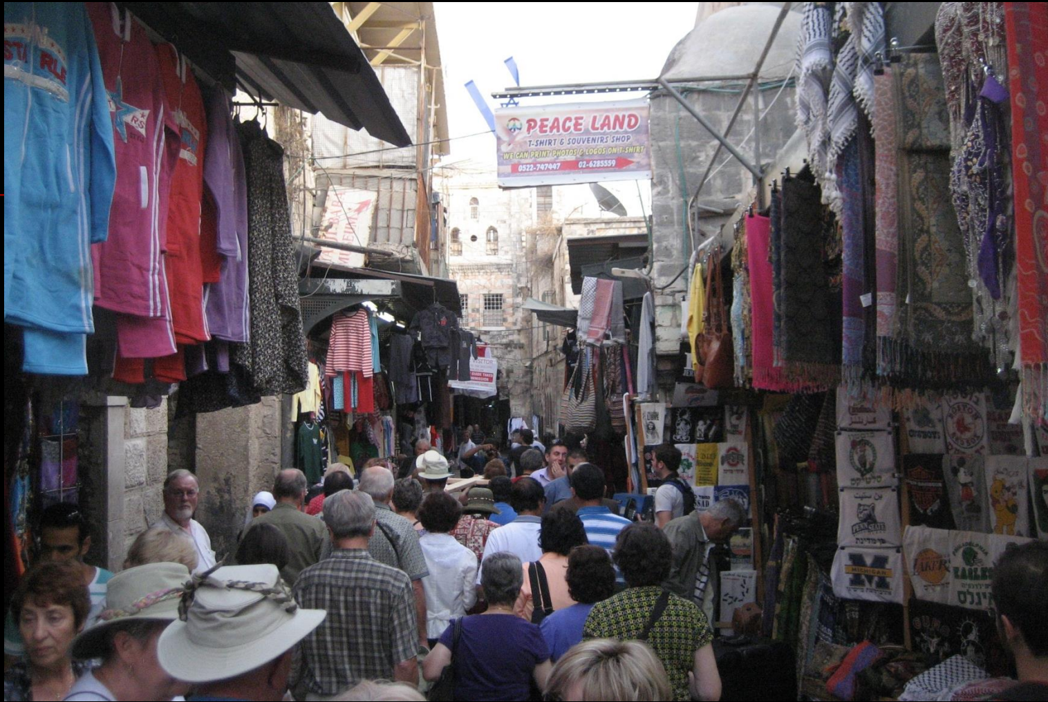
Carrying the cross through the streets