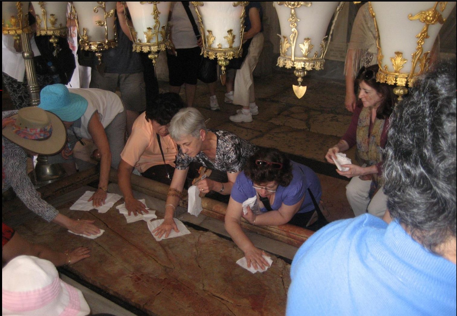
13 th Station: the Stone of Unction where Jesus' body was laid for anointing. Rose oil is poured on it