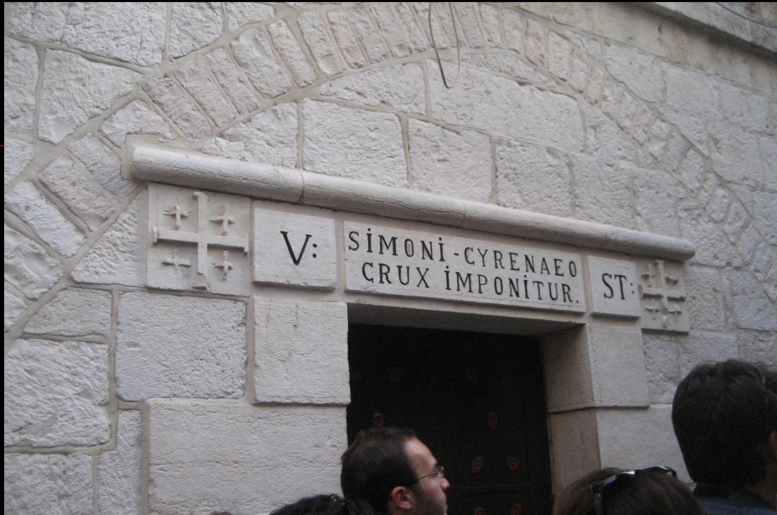
5 th Station: Simon of Cyrene helps Jesus carry the cross