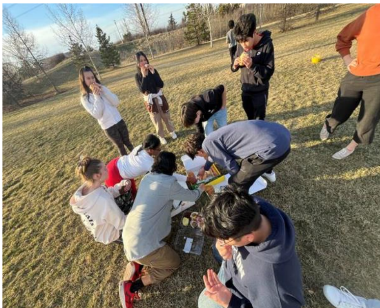
Youth playing kickball at the field and eating subway!