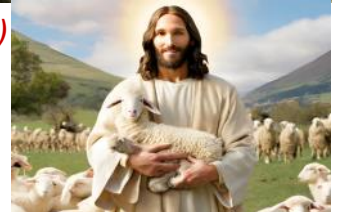
4th Sunday of Easter Good Shepherd Sunday

Sat, Apr 20: Rosary 4:25/Mass 5 pm Sun, Apr 21: Rosary 7:25/Mass 8 am Rosary 9:25am/Mass 10 am Rosary 11:25am/Mass 12pm Rosary 4:25pm/Mass 5 pm