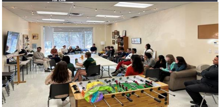
Verso L'Alto (High school) youth group - April 14