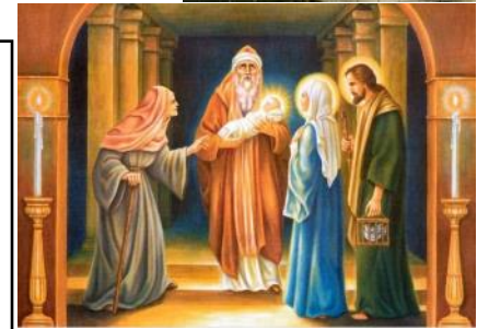
Presentation of the Lord in the temple

1st Saturday: Mass at 9am Communal Rosary 3:55/Mass 4:30 pm Sunday: Communal Rosary 7:25/Mass 8 am Mass 9:30 am (Rosary in Private) Mass 11am (Rosary in Private) Mass 12:30pm (Rosary in Private)