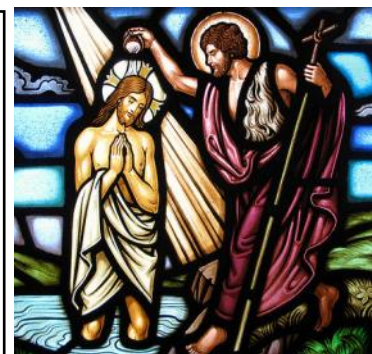
The Baptism of Jesus

SACRAMENT OF RECONCILIATION: 45 MINUTES BEFORE WEEKDAY MASS & Saturday, 3 pm to 4 pm.