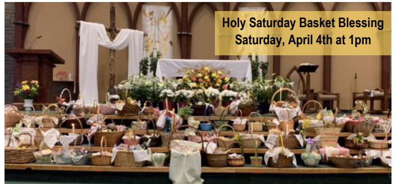
Holy Saturday Basket Blessing Saturday, April 4th at 1pm

Remember to bring your bells to be rung at Mass during the Gloria on Holy Thursday, and again at the Easter Vigil.