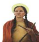
Apr 17 - St. Kateri Tekakwitha