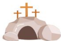
Apr 05 - The Resurrection of the Lord