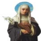
Apr 29 - St. Catherine of Siena