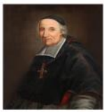
May 06 - St. Francois De Laval