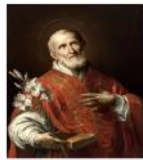
May 26 - St. Philip Neri