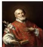
May 26 - St. Philip Neri