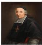
May 06 - St. Francois De Laval